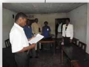
Democratic Republic of Congo