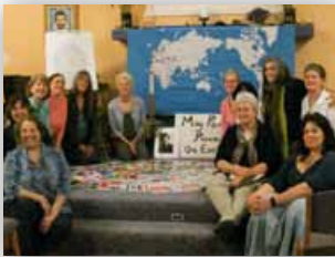
Sandpoint, Idaho, USA

This year again, thousands of peace-loving people in over 50 countries joined Fuji Sanctuary in sending out heartfelt prayers and wishes for peace. Below are photos from a few of the locations where local SOPP ceremonies and prayer gatherings were held in 2011.