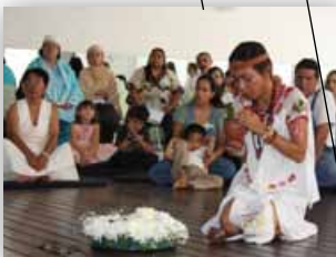
Mexico City, Mexico