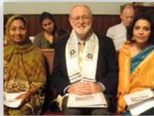
Croton Falls, NY, USA